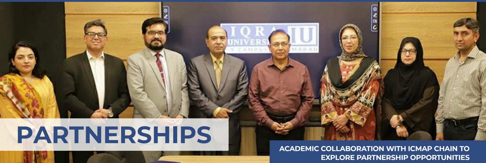
ACADEMIC COLLABORATION WITH ICMAP CHAIN TO EXPLORE PARTNERSHIP OPPORTUNITIES

Iqra University continues to strengthen its global and local presence through meaningful collaborations. Our recent Memorandums of Understanding (MOU's) reflect our commitment to providing students, faculty, and staff with exceptional opportunities for academic excellence, professional development, and community engagement. These partnerships span education, healthcare, sports, hospitality, and international exchange programs. From student discounts at local eateries to postgraduate scholarships at prestigious international institutions, each MOU is designed to enhance the university experience and open doors to new possibilities. Explore how these collaborations are shaping the future of our community.